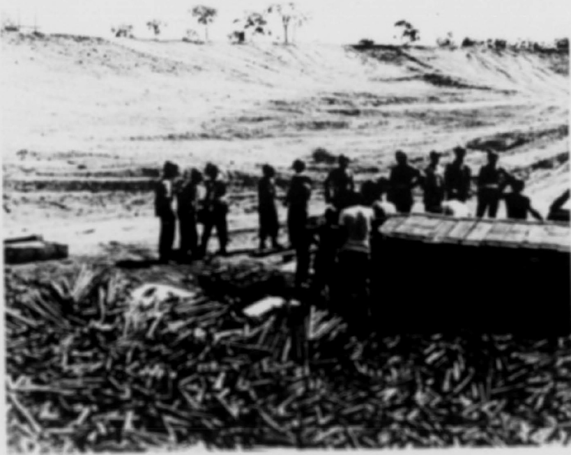
Chemists inspect clusters prior to burning. APO 922