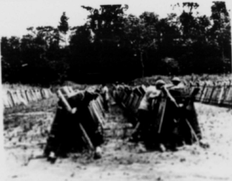
MITAD E buds stored in structure, APO 401