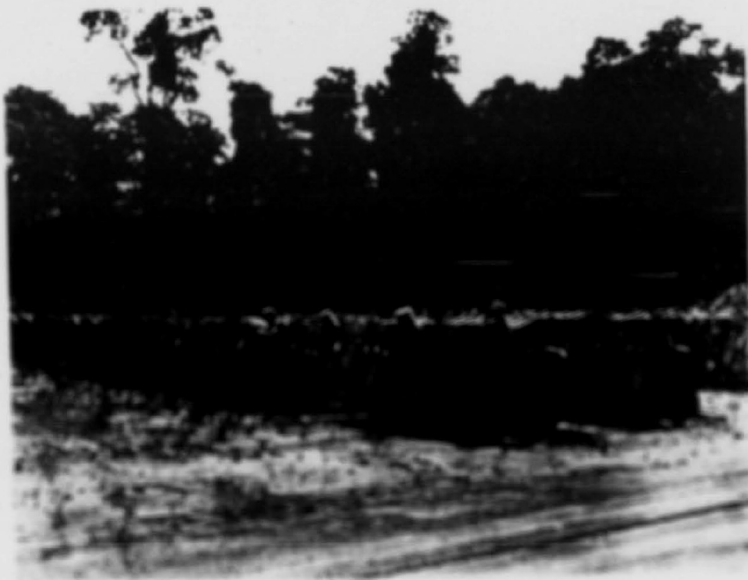
W4742 Bomb stored on stringers. APO 505.