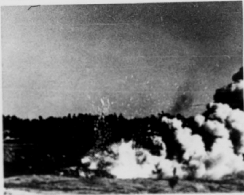
Destruction of obsolete incendi. clusters. APO 922