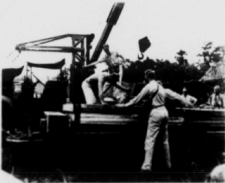
Removing damaged 170, 500 lb CX 3 ab from point of explosion.