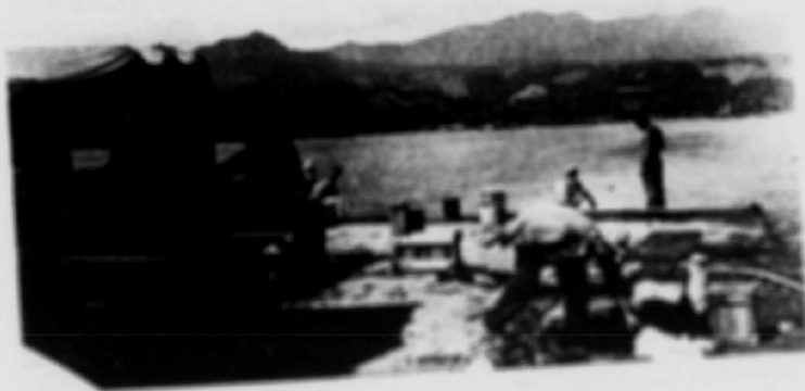
On the way out to sea to dispose of leaking H bombs.