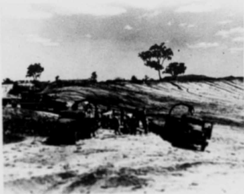
Preparing obsolete invent clusters for destruction. APO 902.