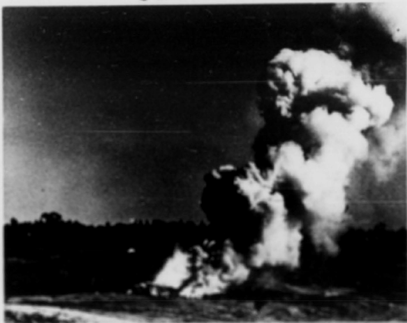
Destruction of obsolete incendi. clusters. APO 922.