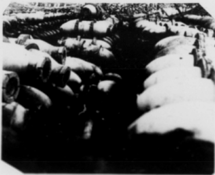
Scene of explosion showing damaged W79, 500 lb. CE bomb.