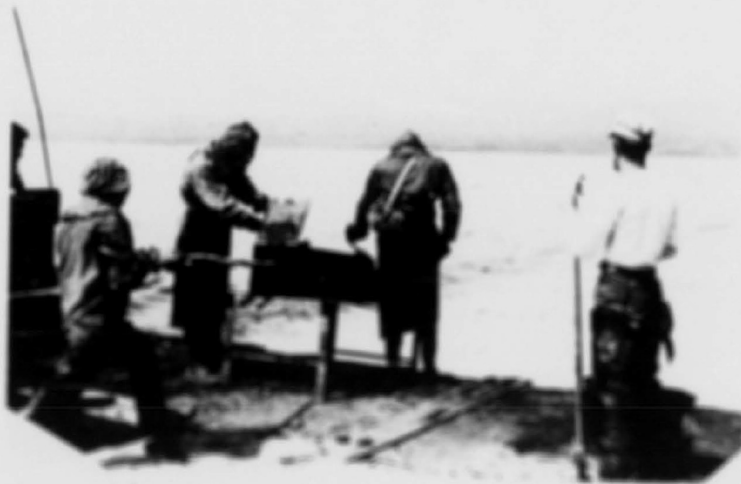
Pushing punctured H Bomb out of disposal table.