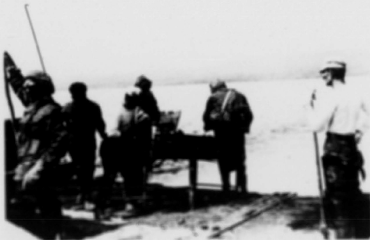
Flaming leaking H Bomb in disposal table.