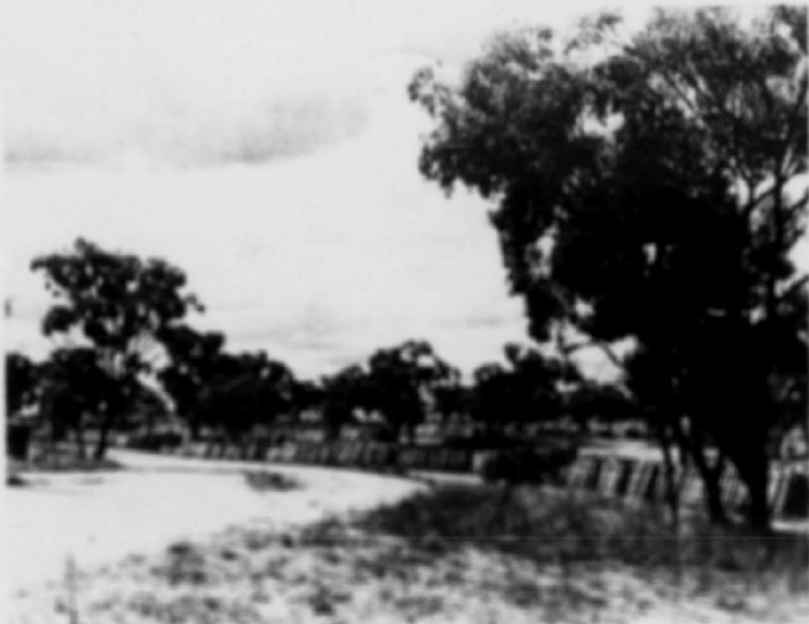
W-747 II bomb storage in Australia