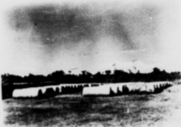
See container storage at APO 111 (N and S filled)