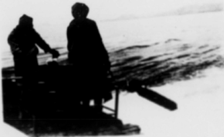
Personnel in boat leaving table.