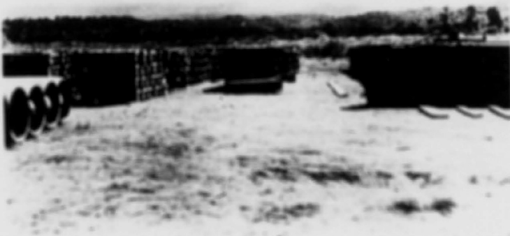
Improved storage conditions existing were noted at this point at APO 903, 907th B Co.